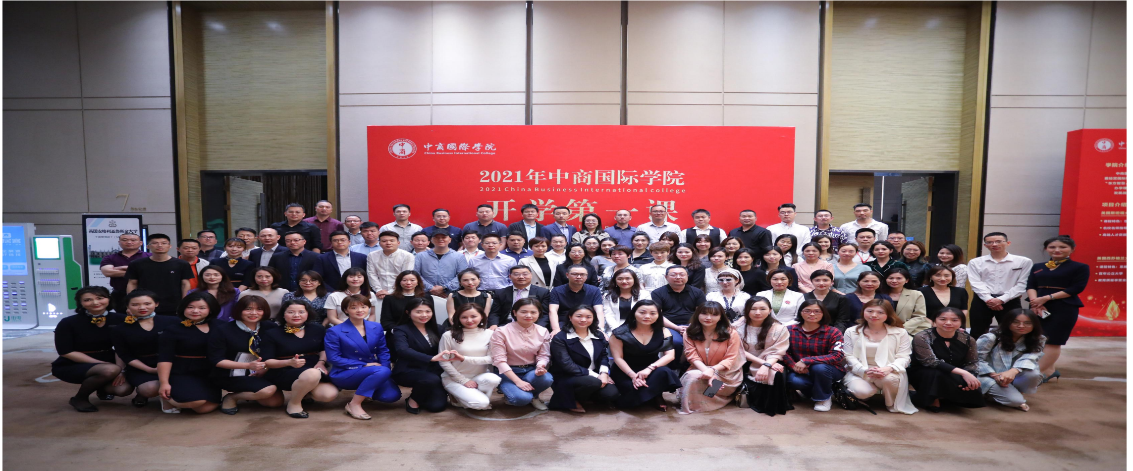
Spring tea party and the first class photo

Eastern wisdom Western operation International vision