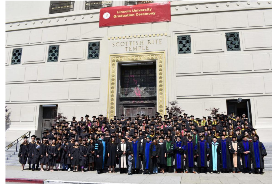
Lincoln University EMBA graduation group photo