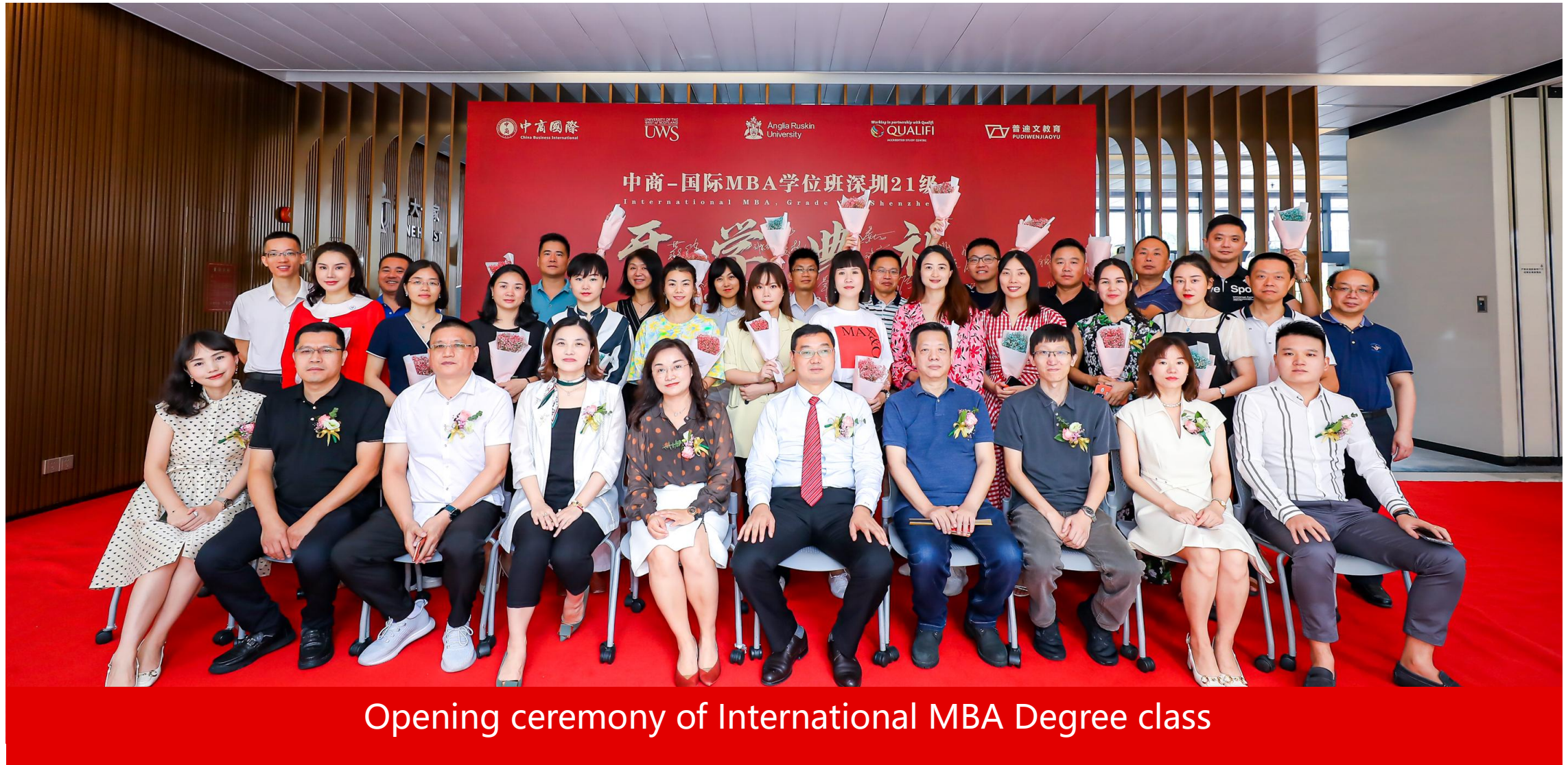
Opening ceremony of International MBA Degree class

Eastern wisdom Western operation International vision