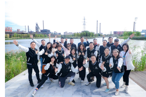
Beijing study tour