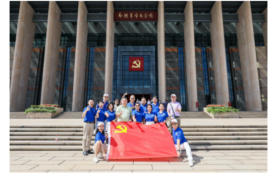
Red study tour